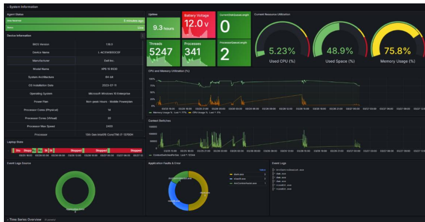
Fig. 2. Illustrative Dashboard Displaying System Resource Usage Metrics

The dashboard is designed in line with visual analytics best practices to ensure that complex technical data is presented in a clear, actionable format for both IT professionals and non-technical stakeholders.